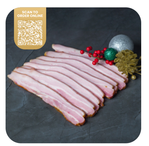
House Smoked Streaky Bacon