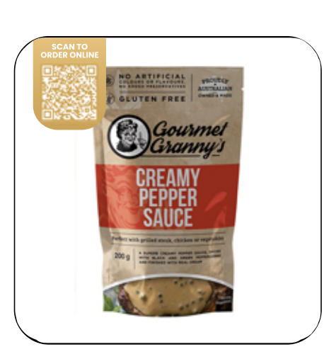
Creamy Pepper Sauce