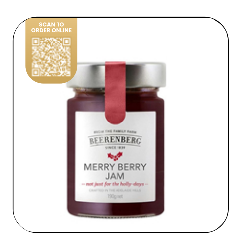
Xmas Merry Berry Jam