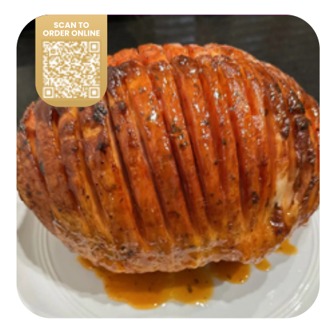
Glaze Boneless Ham