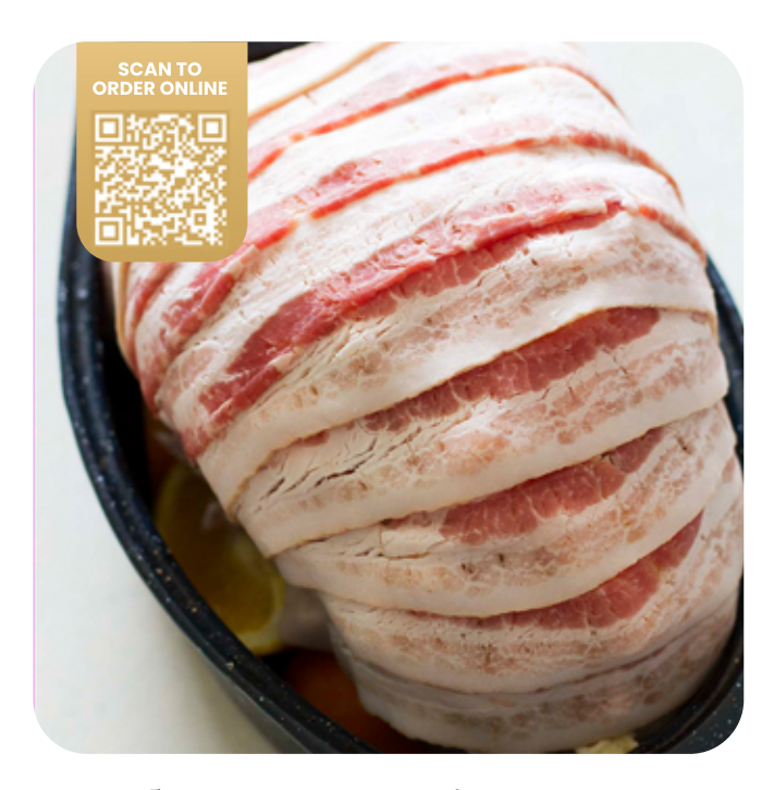
Turkey Bacon Lattice