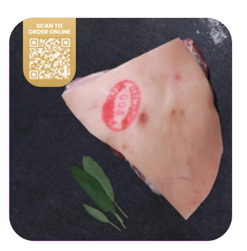
Pork Shoulder Bone In EACH, MIN WEIGHT 2KG TO 4KG