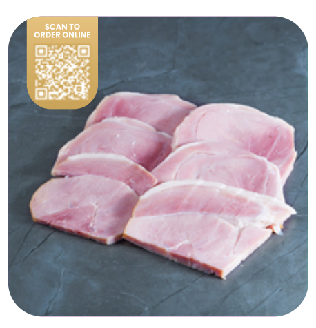
Sliced Smoked Leg Ham