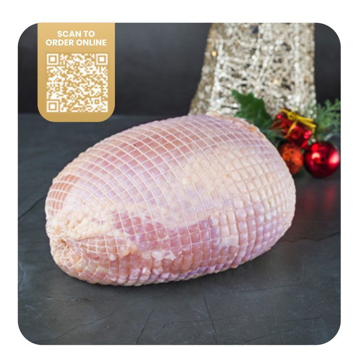
Free Range Turkey Breasts EACH, MIN WEIGHT 1.8KG TO 2.2KG