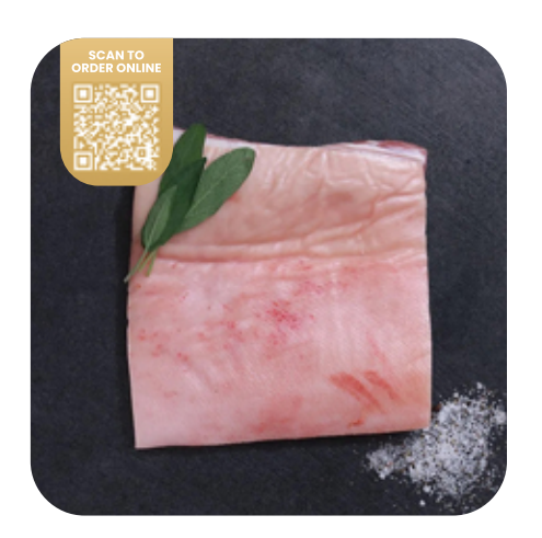
Boneless Pork Belly WEIGHT RANGE BETWEEN 2-3.5KG