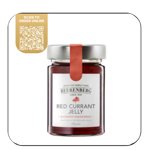
Red Currant Jelly