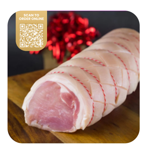
Seasoned Pork Loin WEIGHT RANGE BETWEEN 2KG TO 8KG