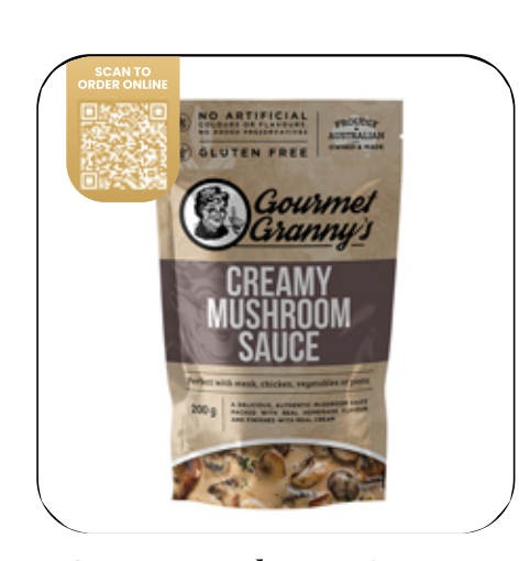
Creamy Mushroom Sauce