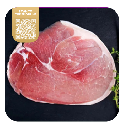
Gammon Joints Boneless WEIGHT RANGE BETWEEN 2KG TO 5KG