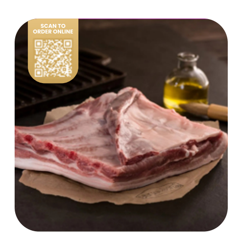
Bone In Pork Belly WEIGHT RANGE BETWEEN 2KG TO 4KG