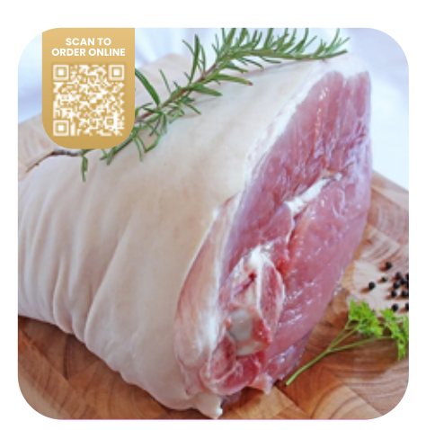
Bone In Gammon