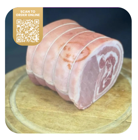
Porchetta Pork Roast Plain WEIGHT RANGE BETWEEN 2-8KG