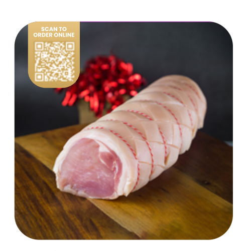
Pork Loin Roast WEIGHT RANGE BETWEEN 2-8KG