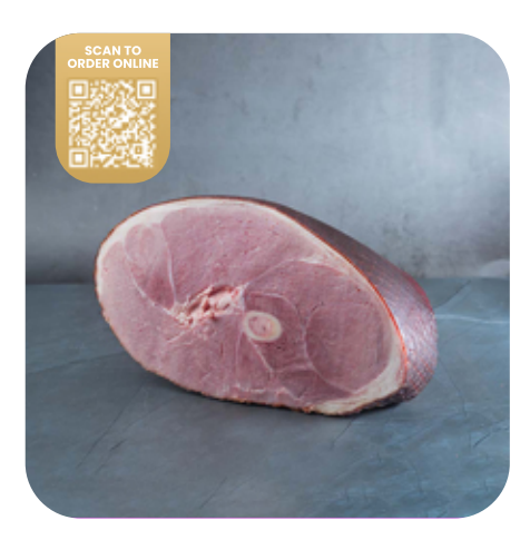
Quarter Ham Bone In EACH, AVERAGE WEIGHT 2.5KG