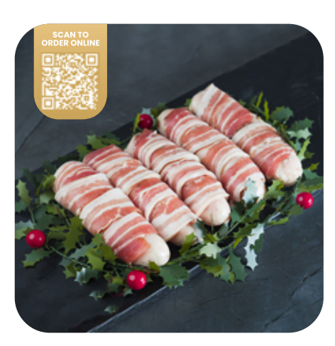
Pigs In Blankets