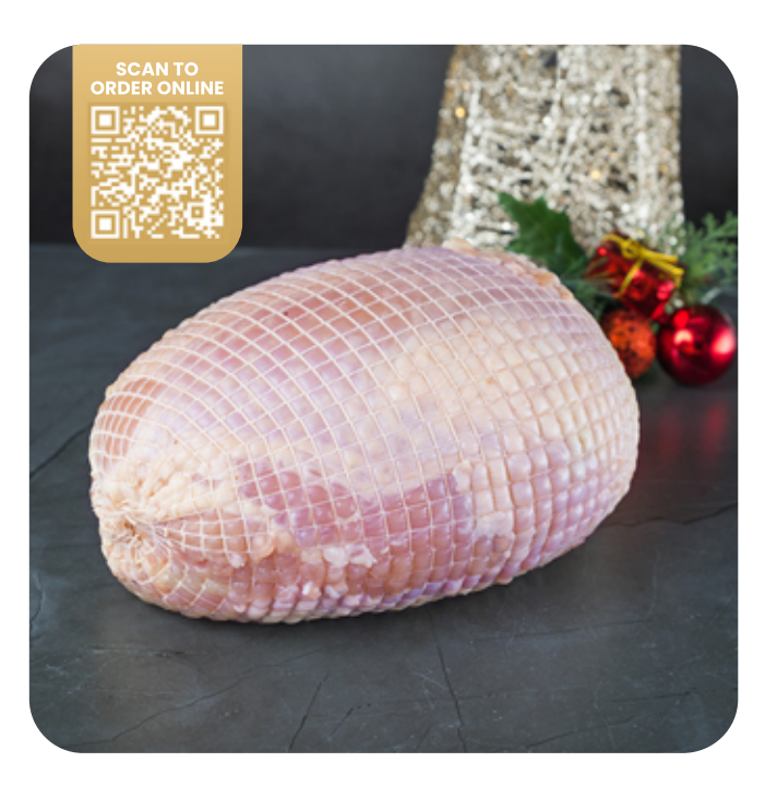
Seasoned Turkey Breast