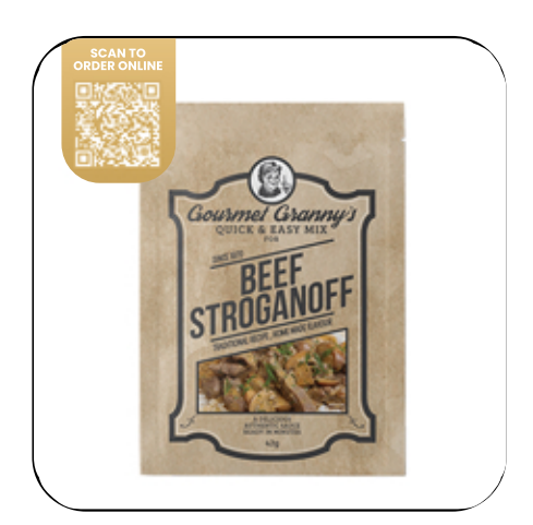
Beef Stroganoff Sauce