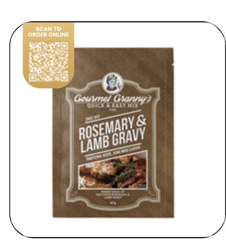
Rosemary & Lamb Gravy