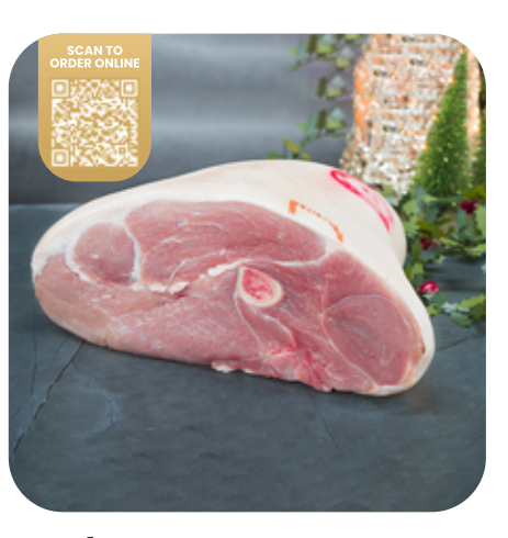
Pork Leg Roast Bone In EACH, MIN WEIGHT 2KG TO 7KG