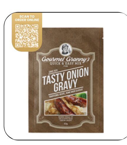
Tasty Onion Gravy