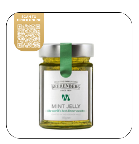
Mint Jelly Sauce