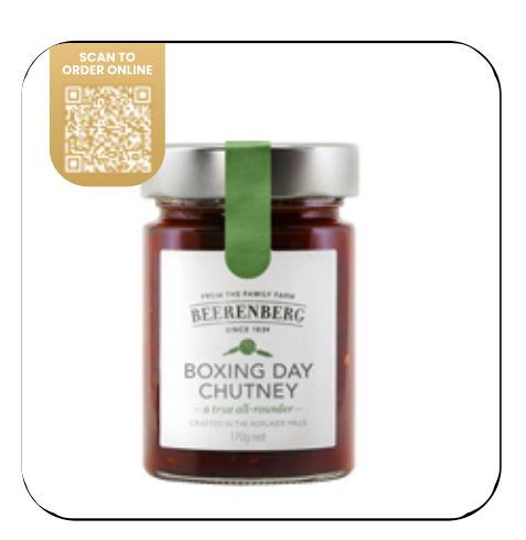
Xmas Boxing Day Chutney Sauce