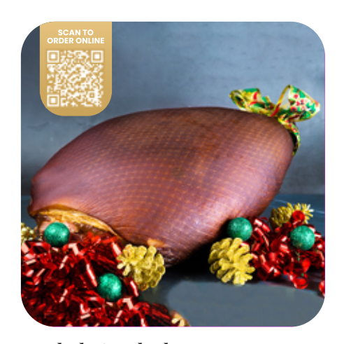
Whole Smoked Ham Bone In EACH, APPROX. 7KG TO 10KG