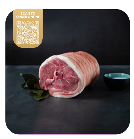
Boneless Pork Shoulder Roast EACH, MIN WEIGHT 2-3KG