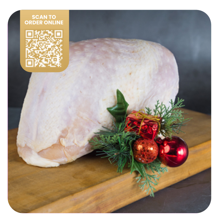
Free Range Turkey Buffs