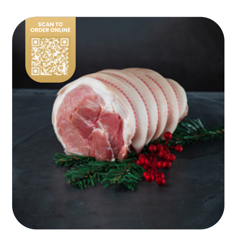
Boneless Pork Leg Roast EACH, MIN WEIGHT 2KG TO 6KG